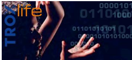
NO 16: ONES AND ZEROS. DIGITAL TRANSFORMATION.