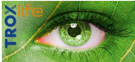
NO 19: SUSTAINABILITY. SUSTAINABILITY IS THE FUTURE.