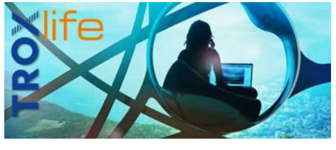
NO 18: COUNTRY AIR, CITY AIR. URBANISATION AND THE CONSEQUENCES.