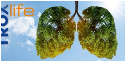
NO 20: AIR + HEALTH. AIR IS LIFE.