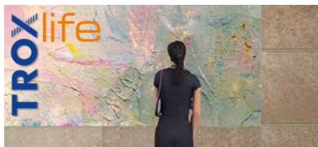
NO 12: ARTS AND CULTURE. ARTFUL AIR DESIGN