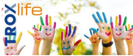
NO 22: SCHOOL + VENTILATION. INTELLIGENT VENTILATION TECHNOLOGY NEEDS TO CATCH